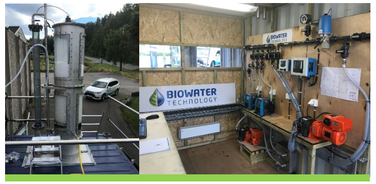
HyVAB pilot container SERVICES

Biowater support customers from the earliest project stages through to handover and service agreements. Early partnering services include sampling and analysis to understand the specific waste water qualities, and pilot trials using our innovative containerised pilot HyVAB plants.