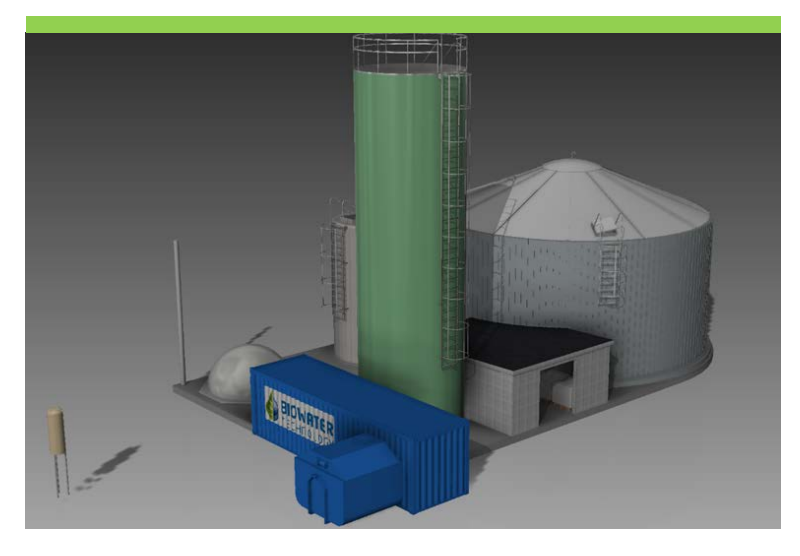
HyVAB project design service including process guarantee

As an ultra-high rate technology, HyVAB offers a footprint significantly smaller than conventional treatment. This is due to an innovative tower arrangement which minimizes sludge production offering considerable saving potential to the end user. HyVAB also offers superb sustainability credentials through the production of a proven high quality biogas biproduct available for power and heat generation, and no odours in operation or in effluent.