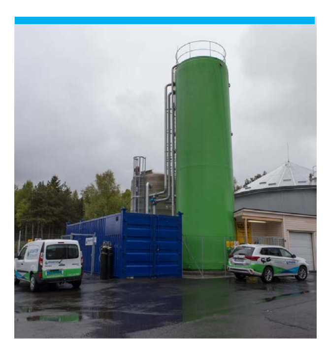
Turnkey HyVAB project delivery by Biowater

High concentration methane (up to 84%) in generated biogas, perfect for energy generation.