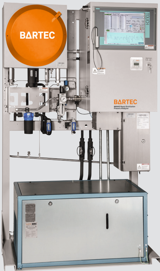
Bartec Benke rapiDist-4 with optional chiller installed.

component substances from a liquid mixture by selective vaporization and re-condensation based on differences in volatilities. This analysis gives important information about the sample properties and as a result, behavior during storage and use. Leveraging Bartec Benke's decades of experience in physical property analysis and an installed base of well above 2000 units, the rapiDist-4 Distillation Process Analyzer was developed to target the growing demands of 21st-century refineries. With highly accurate boiling curve measurements, cycle times as fast as 10 minutes and high closeness to the ASTM D86 procedure, it is the perfect choice for fast process control (e.g. atmospheric distillation columns and blending processes).