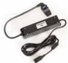
USB communications lead