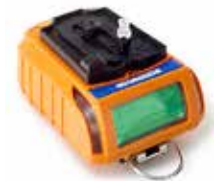
Pumped flow plate