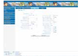
Portables Pro software