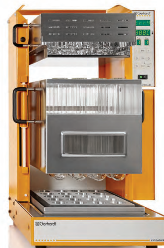
For example KBL 20S TZ