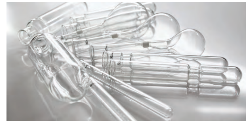
Digestion tubes and Kjeldahl flasks

“The variety of our accessories range is unsurpassed. We can satisfy any requirement.”