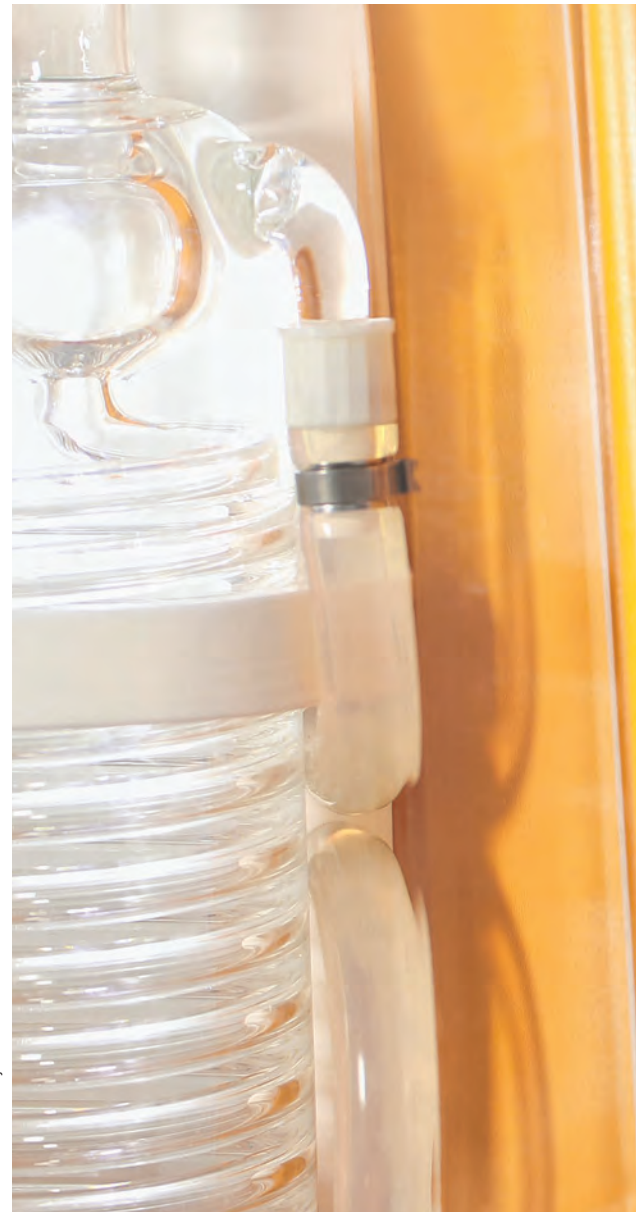
Issue 01/2016 | Subject to technical amendments