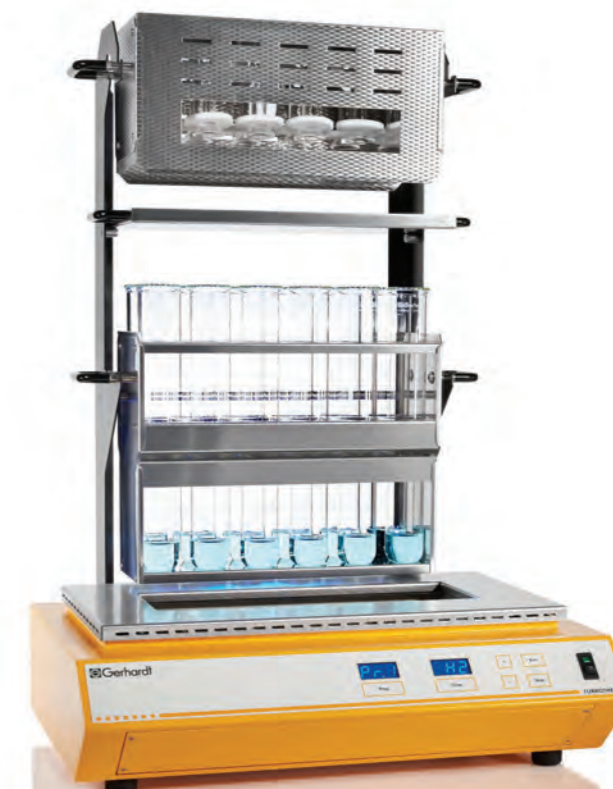
For example TT 125