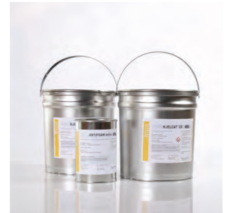
KJELCAT catalysts and anti-foaming tablets