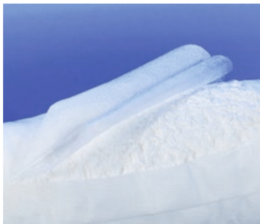
'Spaghetti' fiber matrix