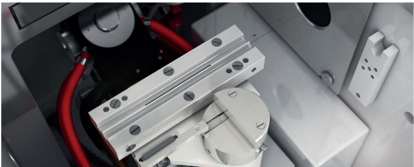
Burner head with Scraper and lowered graphite furnace (novAA 800® D)

The Scraper, an intelligent cleaning device for the burner head improves routines, especially when working with the acetylene-/nitrous oxide flame. It automatically cleans the slot before each measurement and in standby mode, thus guaranteeing a continuous and reproducible measuring cycle. It further contributes to lab safety and precision of results.