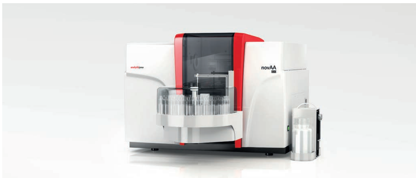
novAA® 800 F with autosampler AS FD for flame technique