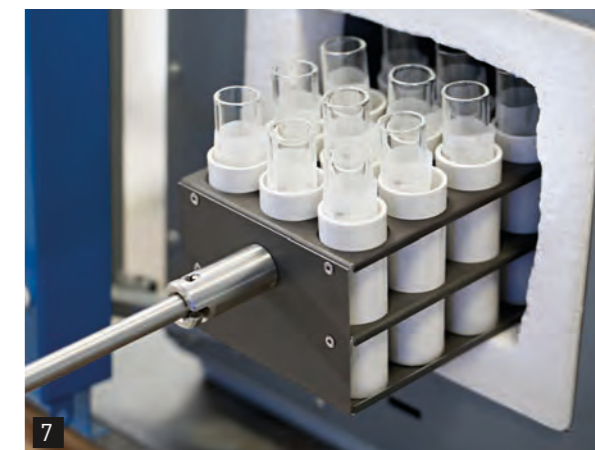
The incinerating module with a long handle makes handling of samples easier.