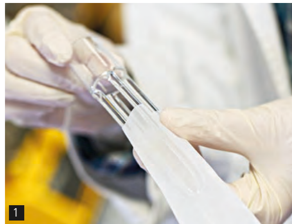
Easy handling: Insert FibreBag, weigh sample and you're ready. No need to seal the filter bag.